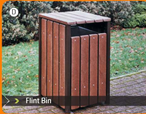
> Flint Bin