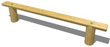
> Balance Beam