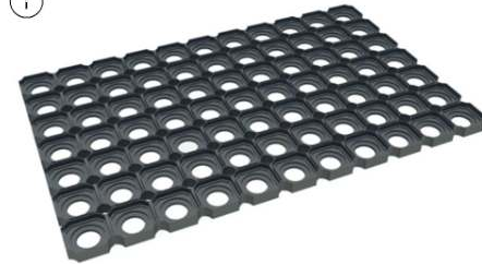
> Grassguard Tile