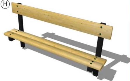
> Clieveden backed bench