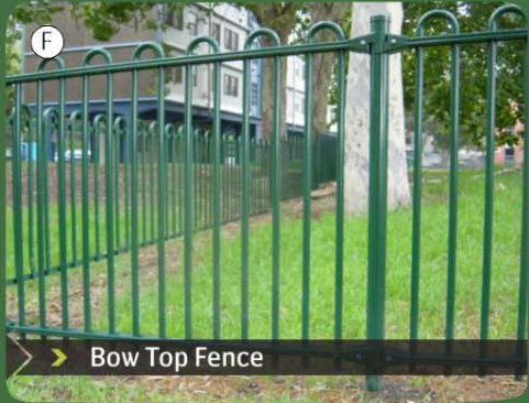
> Bow Top Fence