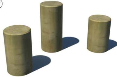
> Stepping Stones